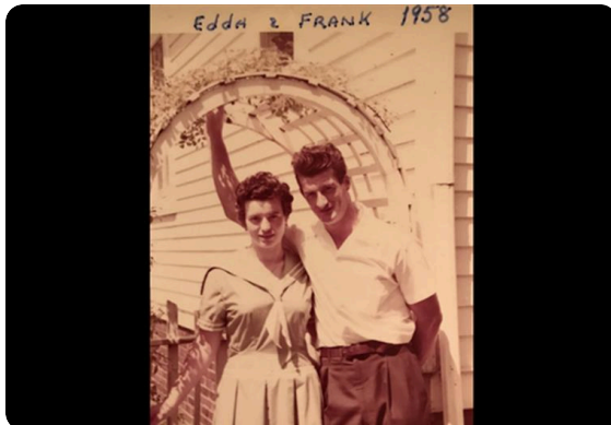
Beautiful couple !