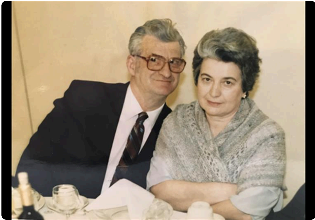
At a family function