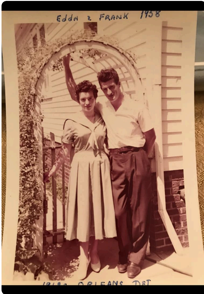
At home in Detroit